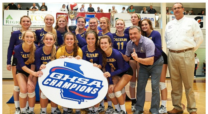
A: Calvary Day