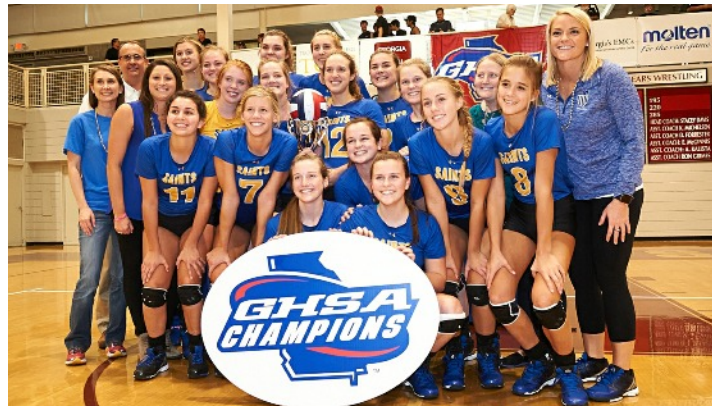
2A: St. Vincent's