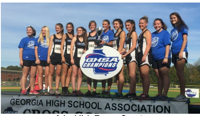
A (public): Towns County