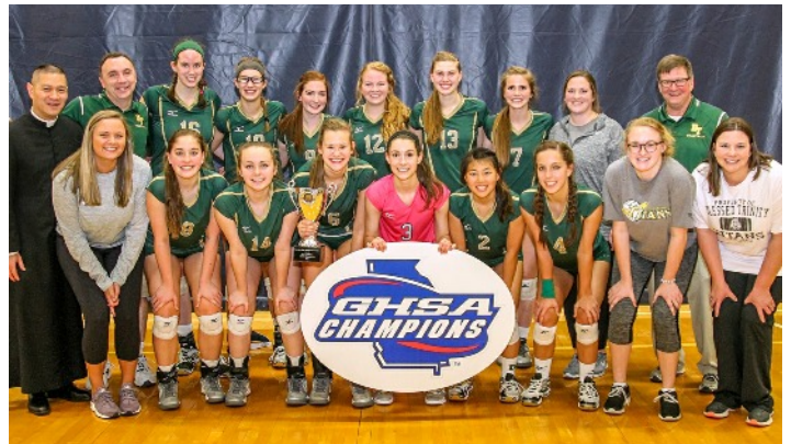
4A: Blessed Trinity