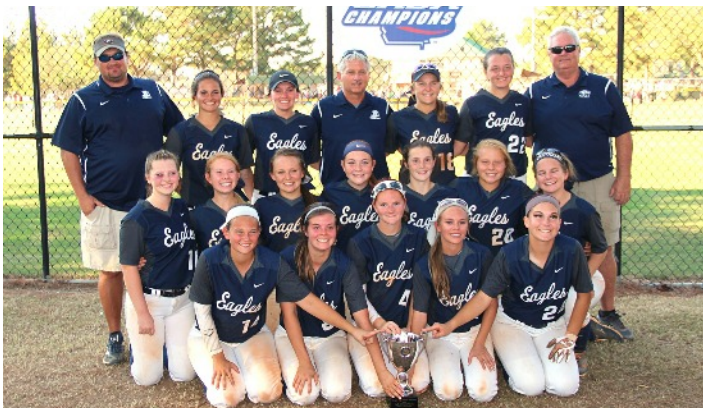
3A: East Jackson