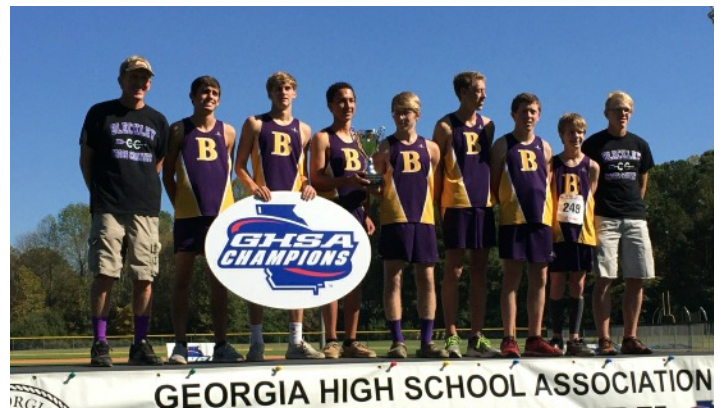
2A: Bleckley County