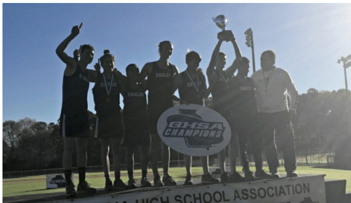
3A: East Jackson