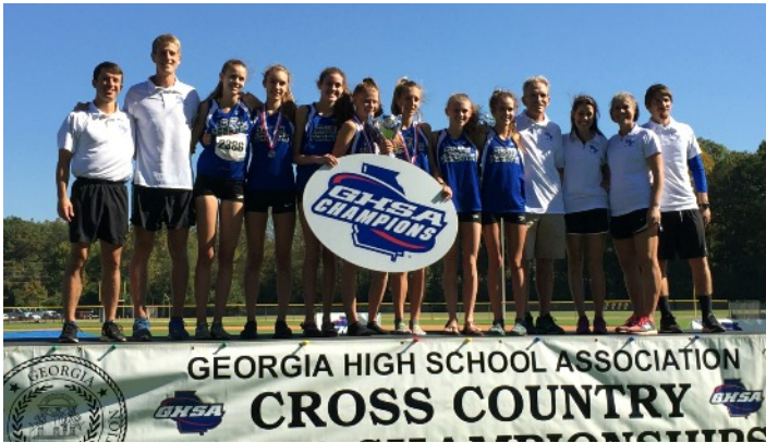
7A: South Forsyth