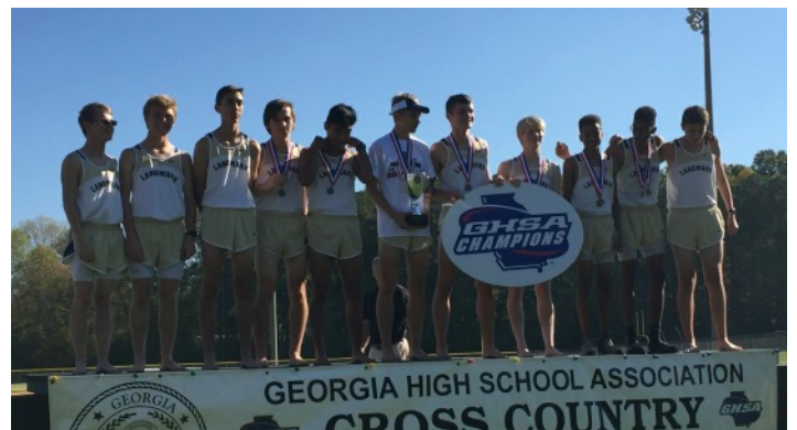
A (private): Landmark Christian