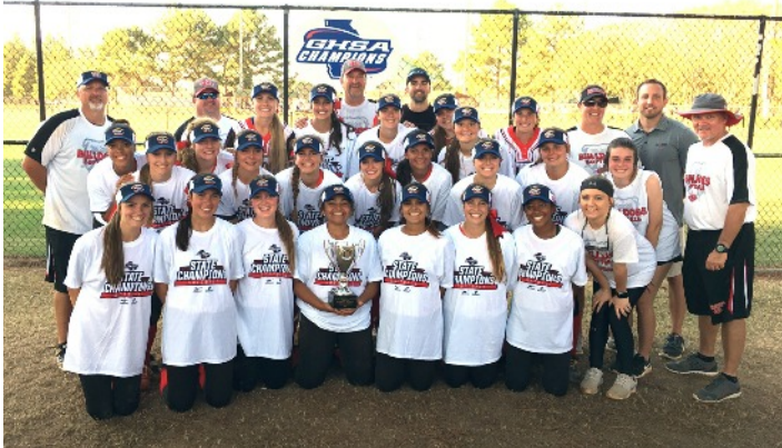
7A: North Gwinnett