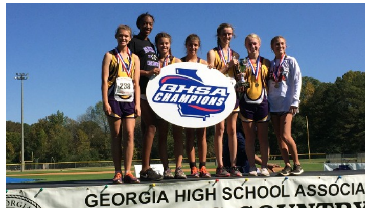
2A: Bleckley County