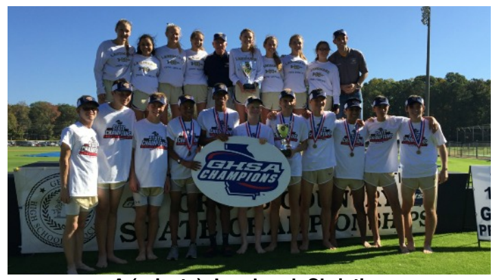
A (private): Landmark Christian