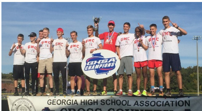
A (public): Georgia Military College