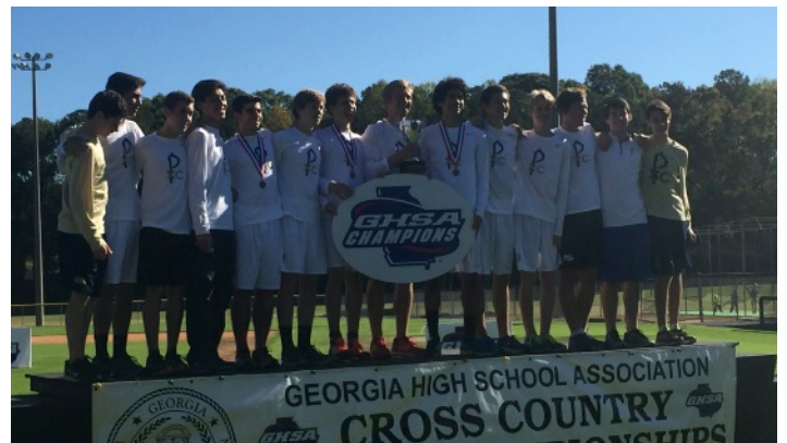
4A: St. Pius