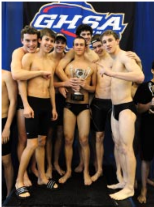
A-AAAA Boys Champion: Wesleyan