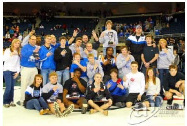
Class A Champion: Bremen