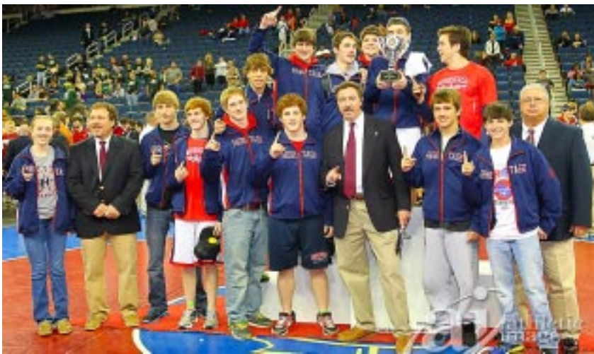
Class AAA Champion: Heritage-Catoosa