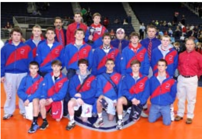
Class AA Champion: Jefferson

Photographs in this newsletter of the state championship teams were provided by Georgia Photographics and Athletic Image . More images may be found and purchased at GHSAPhotos.com .