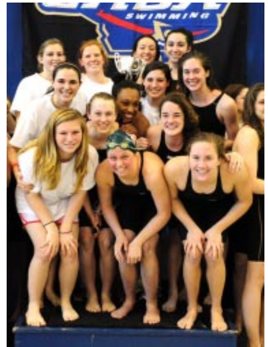
A-AAAA Girls Champion: Westminster