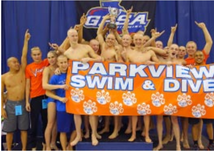
Class AAAAA Boys Champion: Parkview