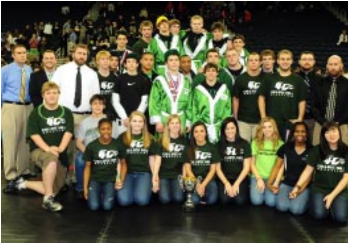
Class AAAAA Champion: Collins Hill