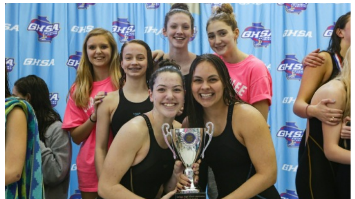
4A-5A Girls: Chamblee