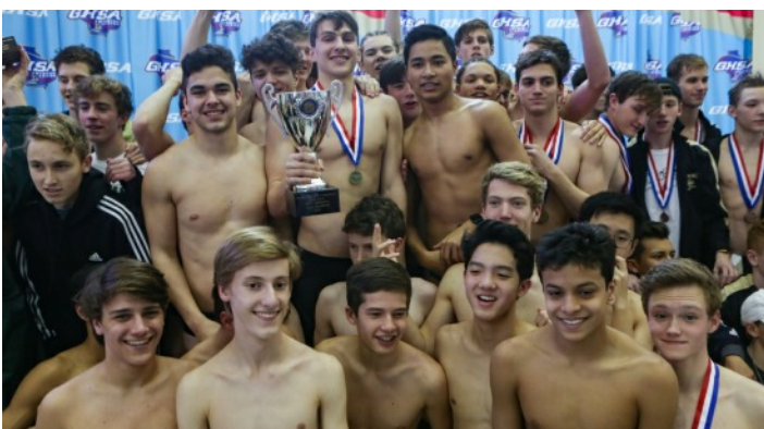
A-3A Boys: Westminster