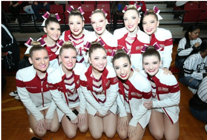
6A-7A: Mill Creek

A total of 50 dance squads performed as coed or all-girls in genres of Jazz, High Kick, Hip Hop and Pom on February 16, 2019 at Mt. Zion High School in Jonesboro.