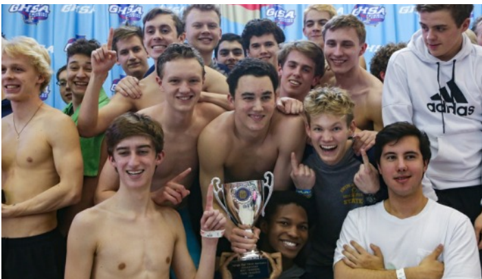
4A-5A Boys: St. Pius