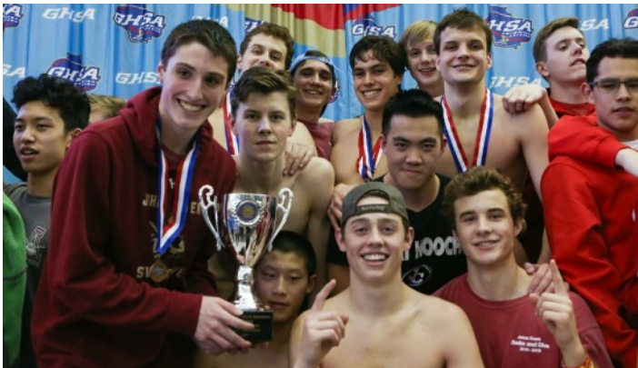
6A Boys: Johns Creek