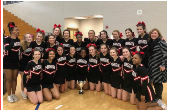
A-3A: Morgan County