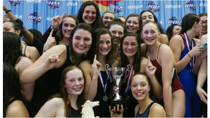
7A Girls: Brookwood