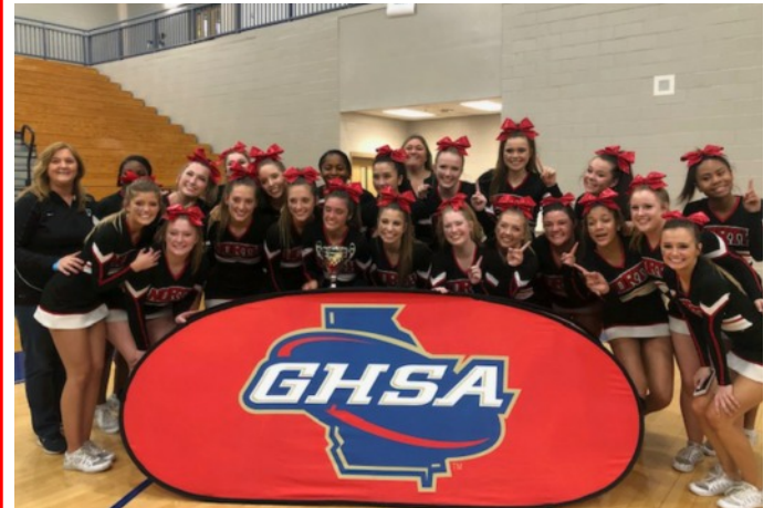
6A-7A: North Gwinnett

Congratulations to Morgan County (A-3A), Denmark (4A-5A), and North Gwinnett (6A-7A), along with all teams that were judged on cheer, band chant, and fight song.