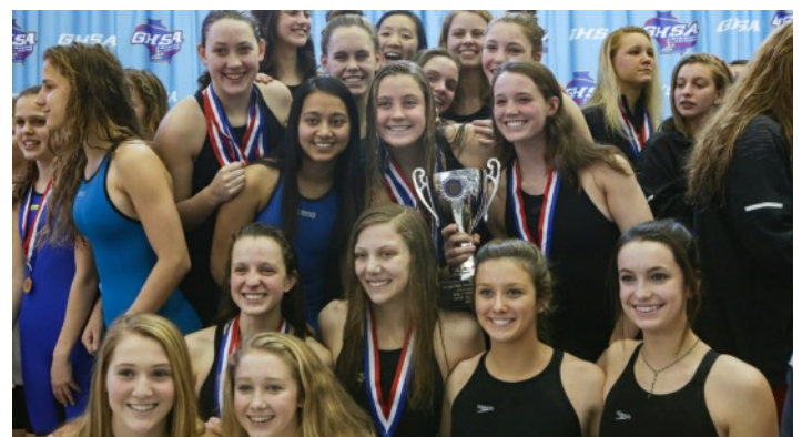
A-3A Girls: Westminster