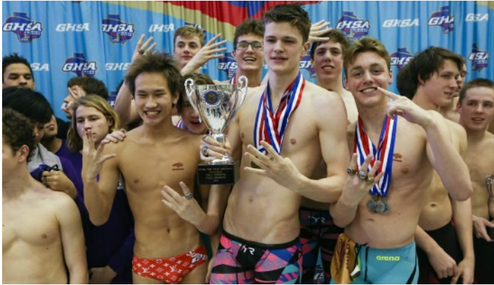
7A Boys: Brookwood