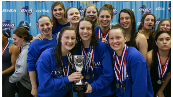
6A Girls: Centennial