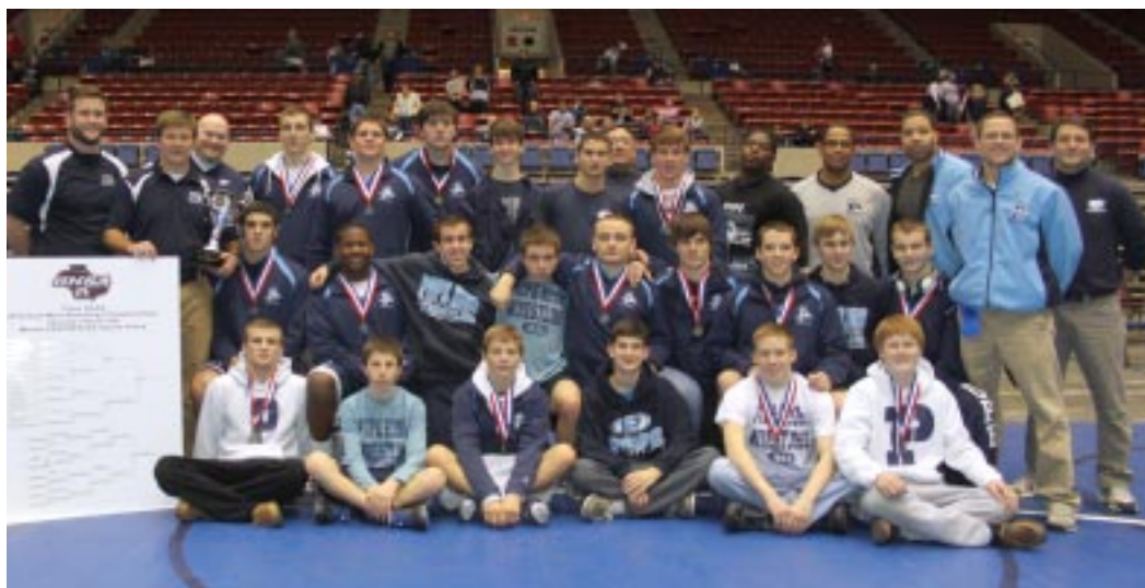
Class AAAA Pope Greyhounds