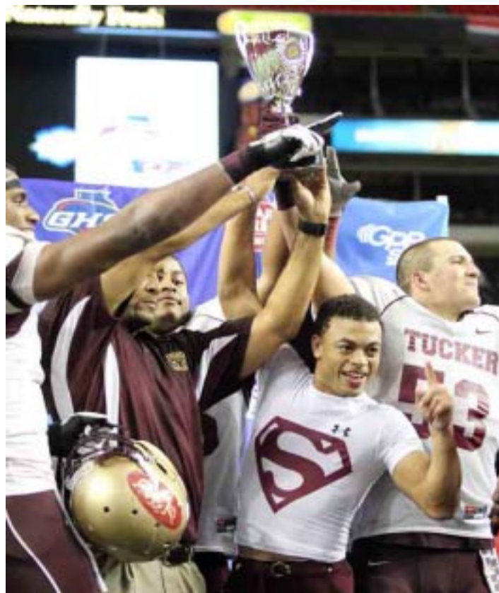
Class AAAA Tucker Tigers