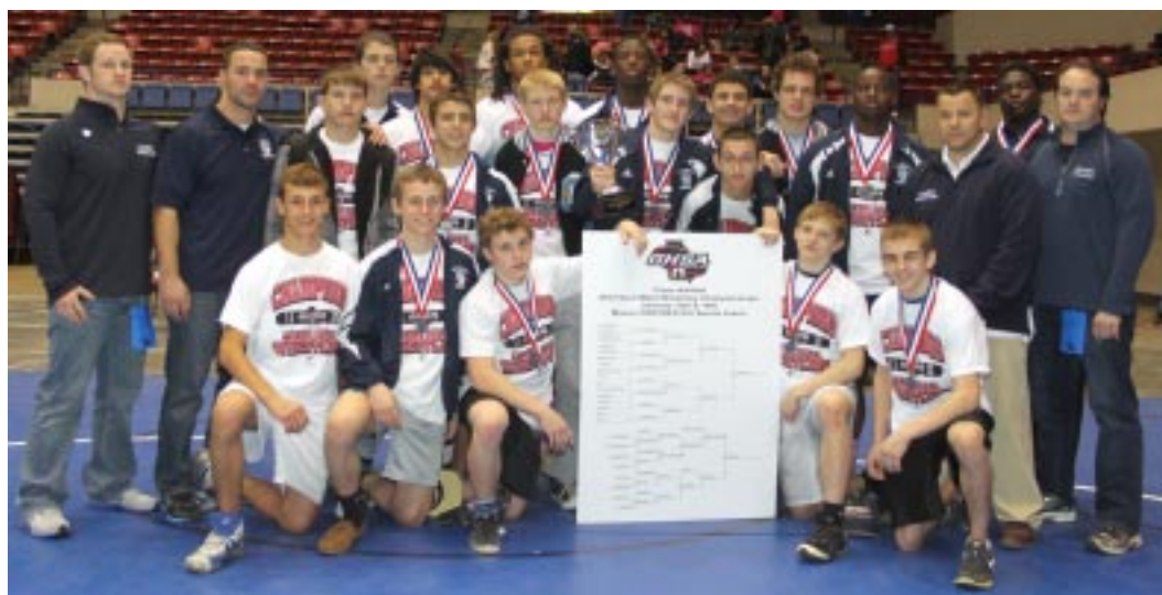
Class AAAAA Camden County Wildcats