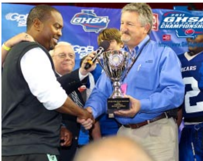
Class AAA Burke County Bears