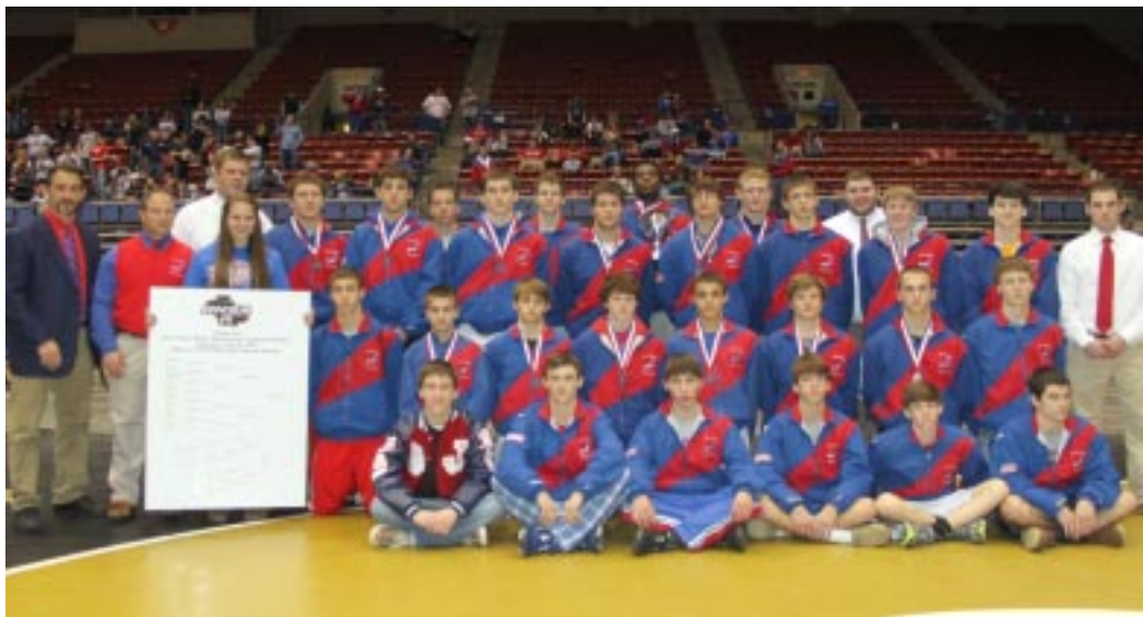
Class AA Jefferson Dragons