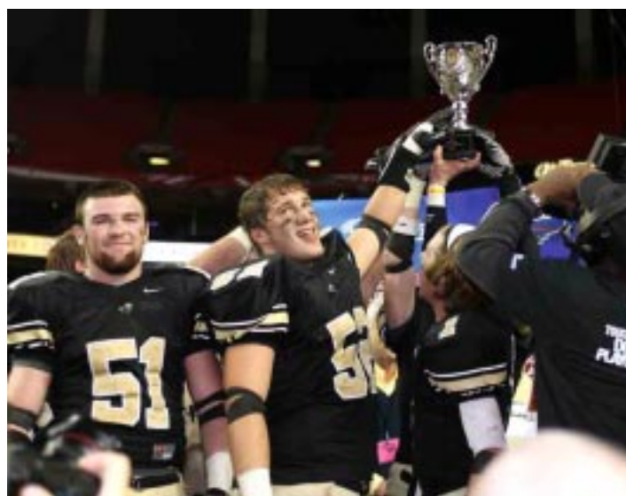
Class AA Calhoun Yellow Jackets