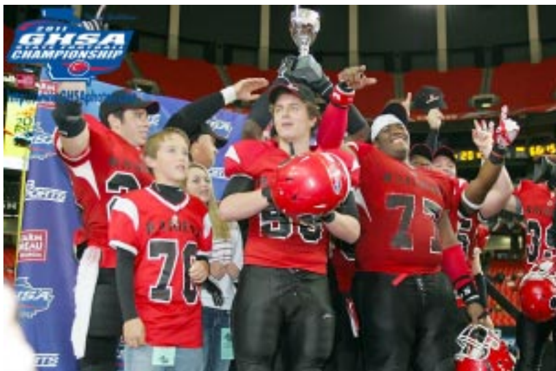
Class A Savannah Christian Raiders