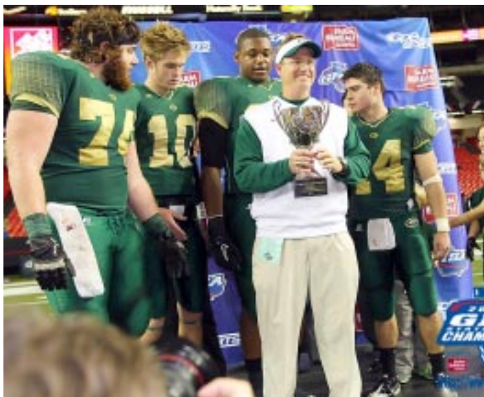
Class AAAAA Grayson Rams