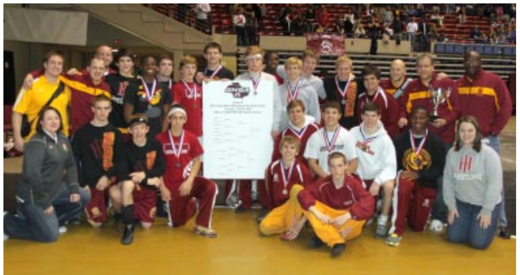
Class A Holy Innocents' Golden Bears