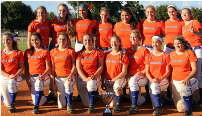
AAAA: Northwest Whitfield Bruins