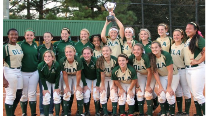
AAAAA: Ola Mustangs