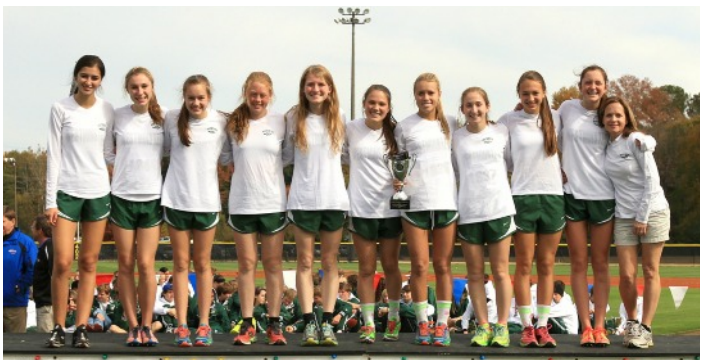
AA (co-champs): Westminster Wildcats