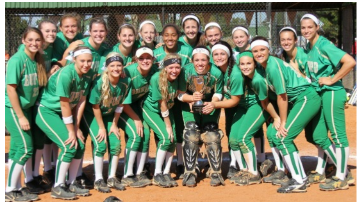
AAA: Buford Wolves