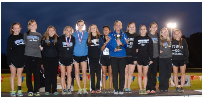
A (public): Towns County Indians