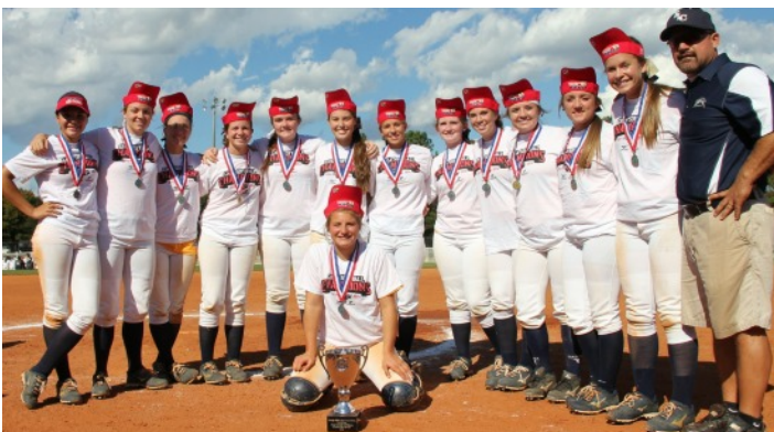
A (private): ELCA Chargers