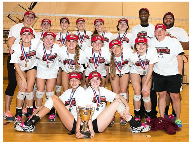
A : Holy Innocents' Golden Bears