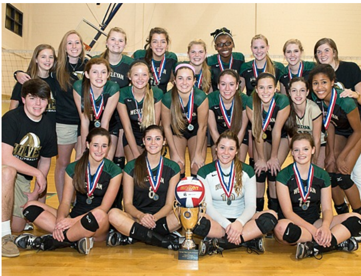
AA : Wesleyan Wolves