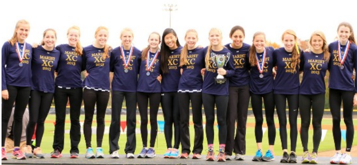
AAAA: Marist War Eagles