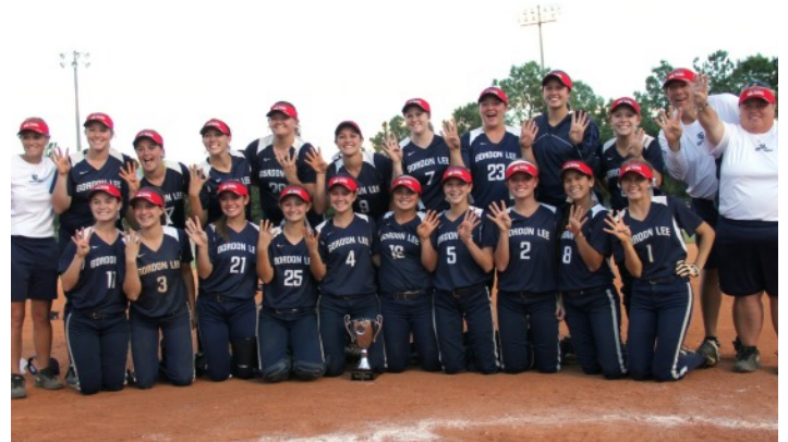
A (public): Gordon Lee Trojans