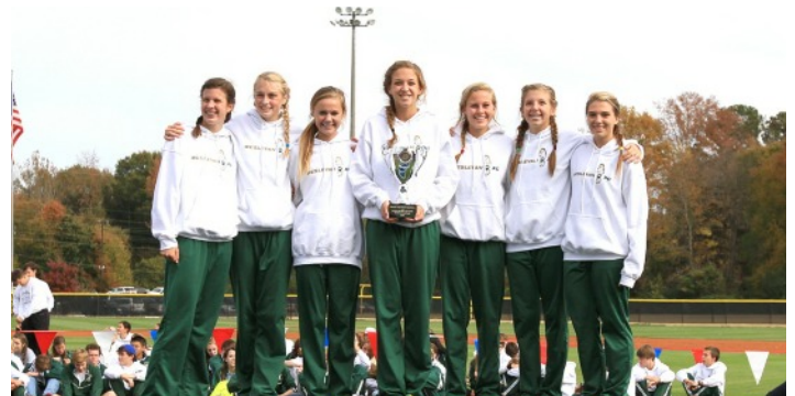
AA (co-champs): Wesleyan Wolves