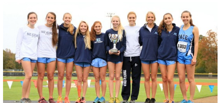
A (private): Pace Academy Knights