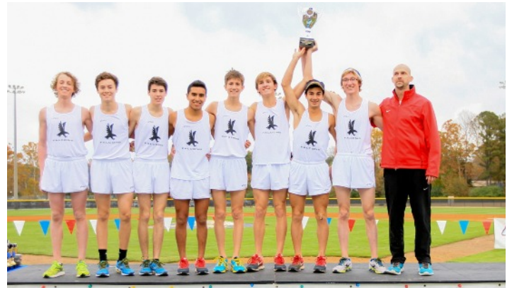
AAAAA: Flowery Branch Falcons