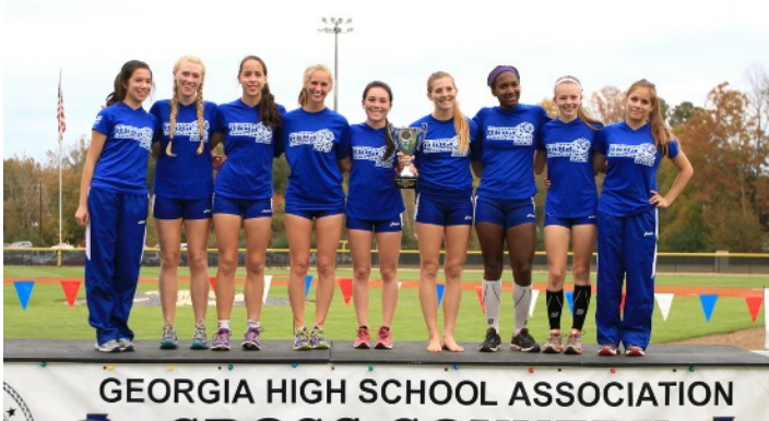
AAAAAA: Peachtree Ridge Lions