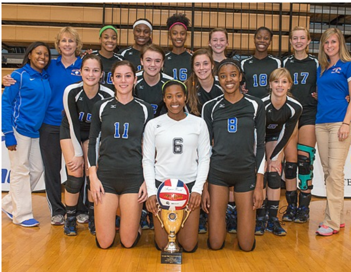
AAAA : Columbus Blue Devils