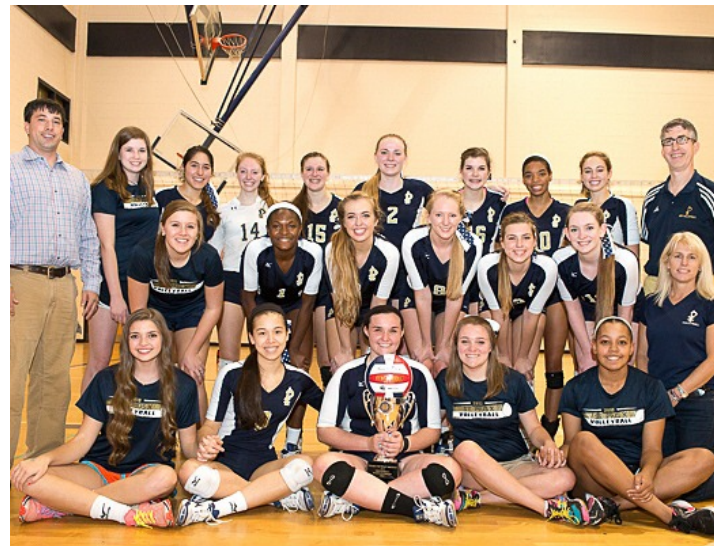
AAA : St. Pius Golden Lions