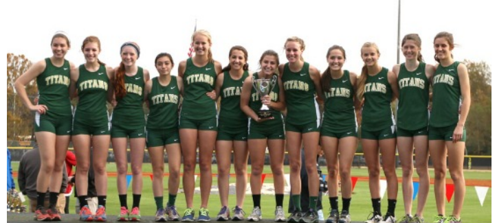
AAA: Blessed Trinity Titans