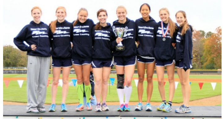
AAAAA: Northview Titans