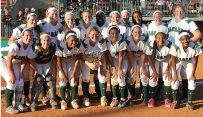
AAAAAA: Collins Hill Eagles