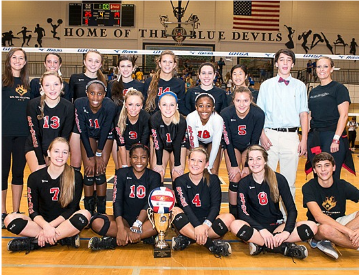
AAAAA : Walton Raiders