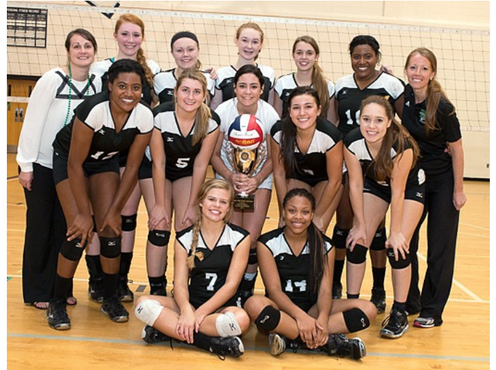
AAAAA : McIntosh Chiefs